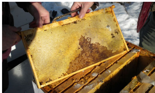
Figure 3. Dead hive (ID# 4-4) treated with 20 µg/kg of imidacloprid which shows the abundance of stored honey and some pollen, but no sealed brood or honey bees. Photo was taken on February 24 th , 2011.

The replicated controlled design of this in situ study in the apiarian setting, and the survival of honey bees in 3 of 4 control hives (figure 4), eliminate the possibility that hive deaths were caused by common suggested risk factors, such as long-distance transportation of hives, malnutrition, or the reported toxic effect of hydroxymethylfurfural, a heat-formed contaminant during the distillation process of making HFCS, to honey bees (LeBlanc et al. , 2009). We used the same HFCS in both the imidacloprid-treated and control hives. The loss of imidacloprid-treated hives in this study is also highly unlikely due to pathogen infection since the presence of neither Nosema nor a large number of Varroa mites was observed in hives during the summer and fall seasons. In addition, all hives were treated with Apistan strips and Fumagillin B, two effective treatments for parasite prevention, prior to the winter season. Since all hives were considered healthy as they went into fall season, those pathogens posed very little threat to the health of honey bee hives. The only dead control hive exhibited symptoms of dysentery in which dead honey bees were found both inside and outside of the hive, which is not seen in the other 19 hives.