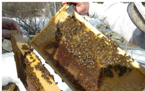
Figure 4. Control hive (ID# 2-5), which shows a cluster of honey bees, some stored honey and uncapped larvae, but no sealed brood. Photo was taken on March 4 th , 2011.