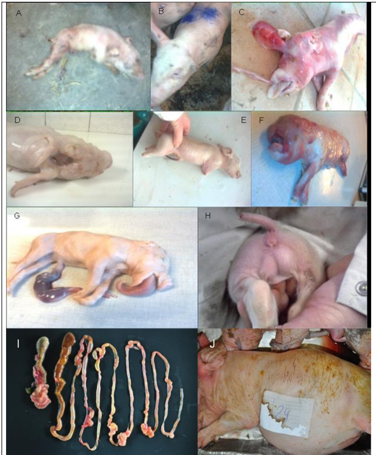
Figure 1: Selected pictures of malformed Danish piglets. A: spinal deformation, B: ear is not formed, C: cranial deformation, D: cranium hole in head, E: piglets born alive having short legs and one eye not developed, F: one large eye, an elephant trunk with bone in it, G: elephant tongue, H: female piglet with testes, I: fore gut and hind gut of the piglet with swollen belly are not connected, J: malformed piglet with swollen belly.

The researchers note, "Further investigations are urgently needed to prove or exclude the role of glyphosate in malformations in piglets and other animals."