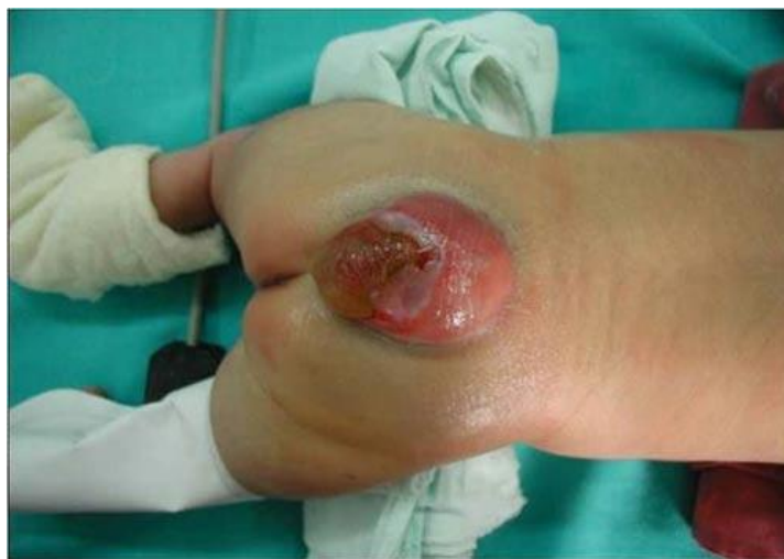
A baby with a neural tube defect; this is a meningo-myelocele. More extensive defects can occur. Hospital de Posadas, Misiones, Argentina.