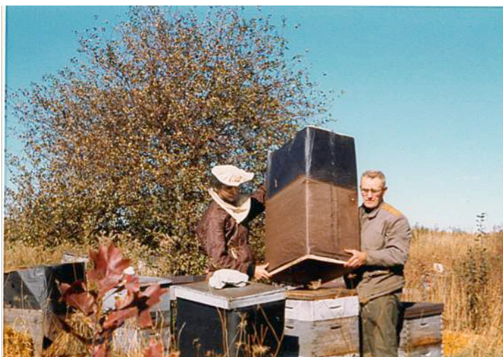
Figure 6. Old hive boxes are often warped or damaged at the corners. Such hives must be wrapped for winter or the bees will suffer from killing drafts. These hives are being covered with foldable, reusable insulating jackets made of corrugated waxed cardboard and tar paper.

Your hive furniture should be tightly fitted together. Bees do not heat the hive, they only heat their cluster. Drafts can drain the heat out of the bee cluster and will kill the bees. If you have old brood boxes that are warped or display hive tool damage, such boxes will have gaps that can