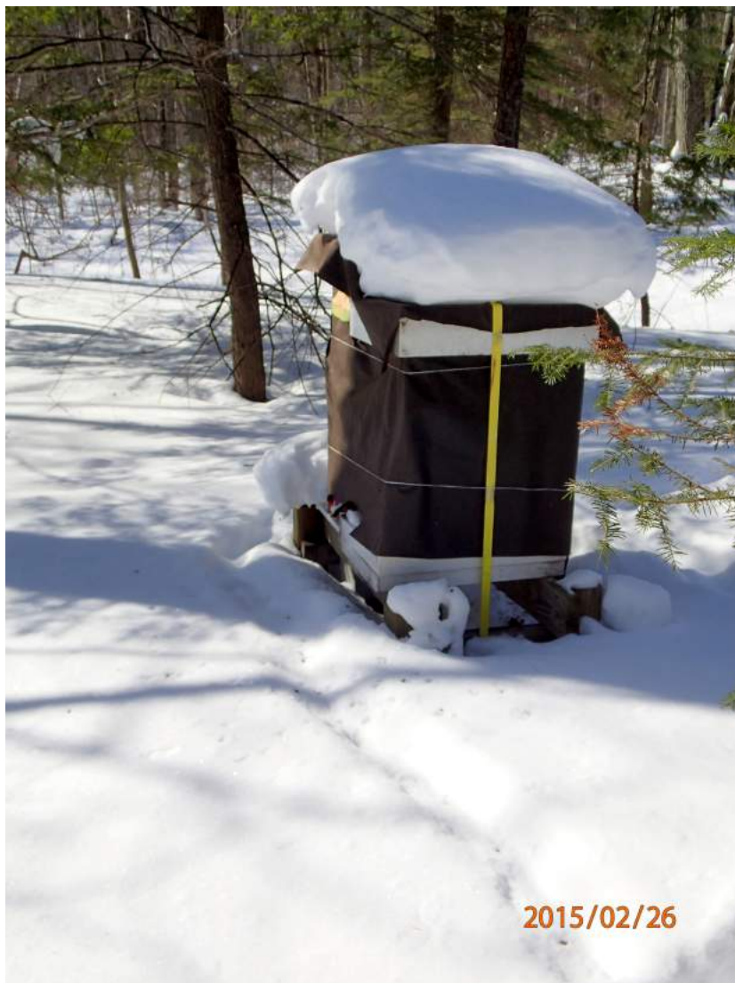
Figure 4. Beehive packed for winter. This hive is protected from direct wind by a tree barrier. It has been wrapped with tar (roofing) paper, an upper entrance was provided at the rim of the inner cover under the insulated telescoping cover, and it is strapped to the hive stand to help prevent accidental toppling due to wind, animals, or vandalism.

Both extrinsic and intrinsic factors will impact the ability of a colony to survive the winter. The main extrinsic factor affecting survival is weather . Winters vary considerably...they may be wet and cold, dry and cold, wet and mild, dry and mild, windy, icy, etc. We cannot control or even reliably predict the weather, but we can optimize colony housing conditions and food stores. It is important to choose a suitable hive location, ensure that hive furniture is in good condition and properly ventilated, and leave adequate honey stores in the hive. All these things can be readily optimized by the beekeeper and must be done while temperatures during the day are still above 50°F (10°C) because opening colonies in the cold is at best stressful, and at worst, lethal.